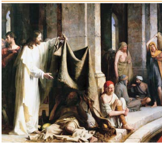
EXCERPTS FROM THE LECTIO FOR MASS © 2001, 1998, 1997, 1986, 1970, CCB.