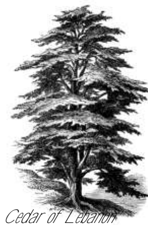
Cedar of Lebanon