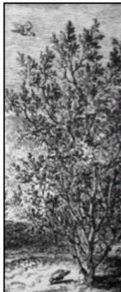
17th century illustration of a mustard plant with birds